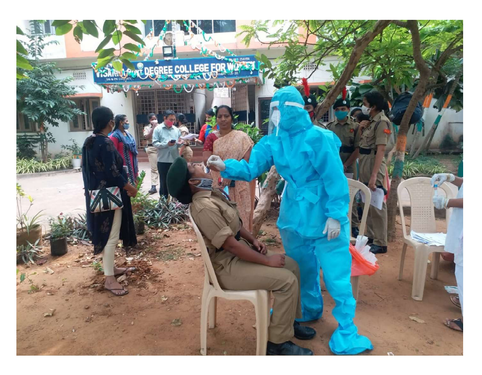
Corona Testing done by Health Staff